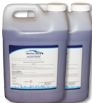
2 - 2.5 Gallon Jugs Per Case