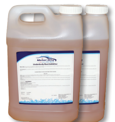
2 - 2.5 Gallon Jugs Per Case