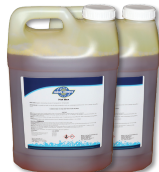
2 - 2.5 Gallon Jugs Per Case