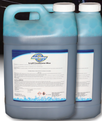
2 - 2.5 Gallon Jugs Per Case