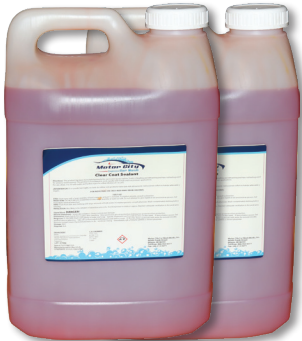
2 - 2.5 Gallon Jugs Per Case