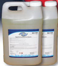
2 - 2.5 Gallon Jugs Per Case