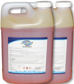
2 - 2.5 Gallon Jugs Per Case